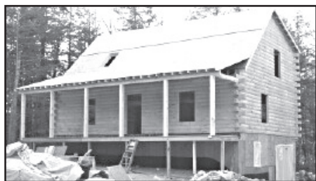
THE DONAHUE'S, MOULTONBOROUGH, NH

KEEP AN EYE ON OUR WEBSITE FOR UPCOMING LOG HOME BUILDING SEMINARS!!!