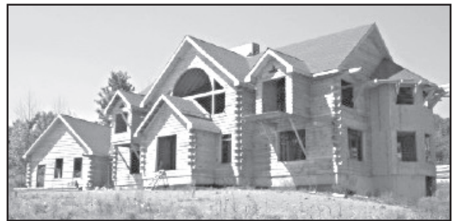
THE WOODAREK'S, SPRINGVILLE, NY